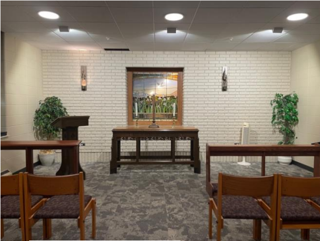
Grace UMC Chapel

Once your date request has been approved, a Grace wedding coordinator will contact you approximately four months prior to your wedding date to assist in planning the details of your wedding. Your coordinator will be your liaison with the church, attend the wedding rehearsal and wedding, and be your resource for logistical questions about your wedding day.