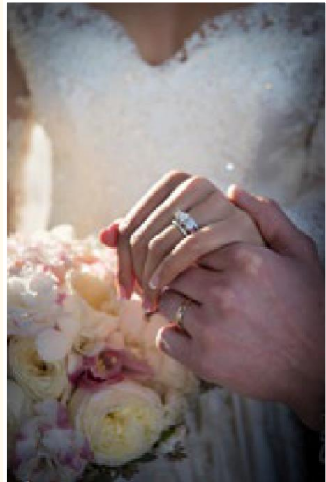
ALEX CLANEY PHOTOGRAPHY